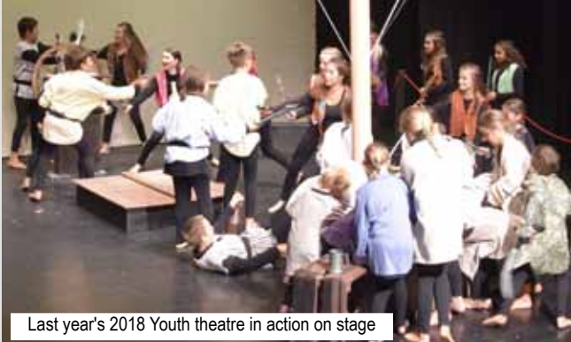
Last year's 2018 Youth theatre in action on stage

Otamatea Repertory Theatre's Youth Theatre programme runs over two separate weeks. The second week is totally booked, but there are still limited spaces for Week One January 14 th -18 th , 2019.