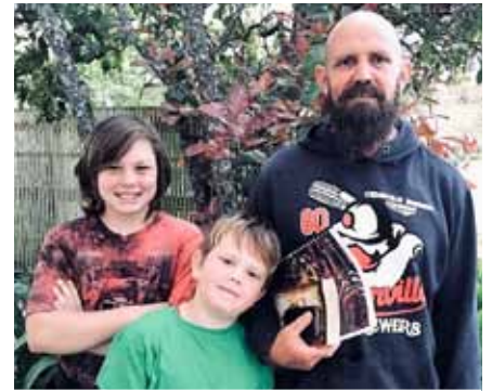
The 3 "most troublesome members" of Sleeping Beauty - Mr 10, Mr 7 and Mr 40+

Mr '40 something' gained new confidence from the whole exercise, so much so in fact we wish he'd lose a bit so his head can fit through the doors. There were daily singing competitions, where he and Mr 10 would duel their vocal