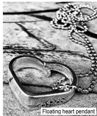
Floating heart pendant