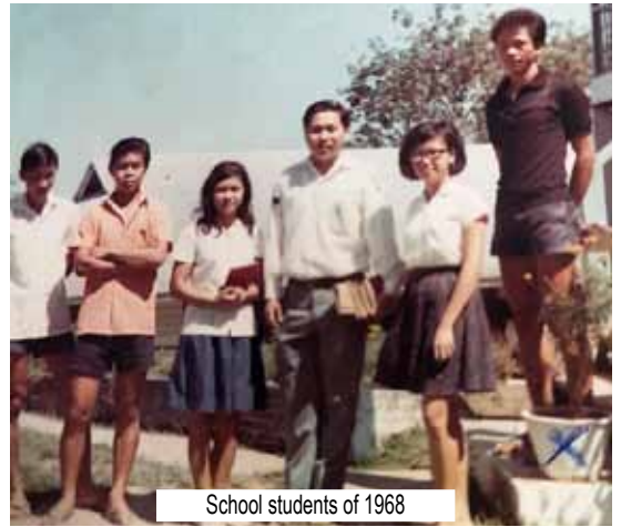
School students of 1968

At year's end he reluctantly returns home to follow a teaching career that leads