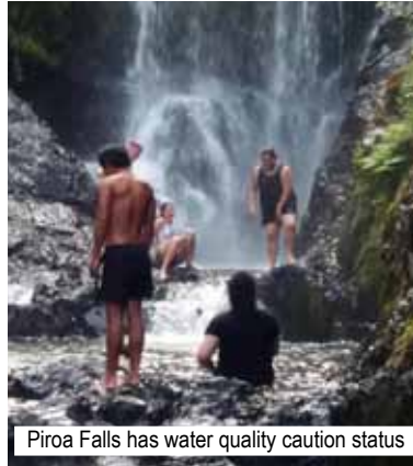
Piroa Falls has water quality caution status

Any water quality concerns can be reported to council's freephone 24/7 Environmental Hotline on 0800 504 639.