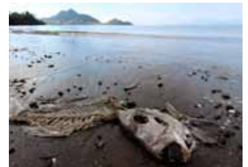
Discarded fish on Whangarei Heads beaches

Disposal options include taking waste home and burying it, or disposing of it out at sea into deep, well flushed water.