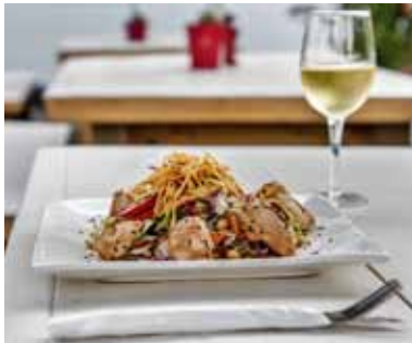
Summer menu choice at the Thirsty Tui

On the Christmas menu was traditional lamb or delicious confit duck followed by Christmas pudding or creamy berry meringue plus Christmas crackers and of course lots of cheer. Many groups took advantage for their end of year functions and had a set menu designed specifically to their needs.