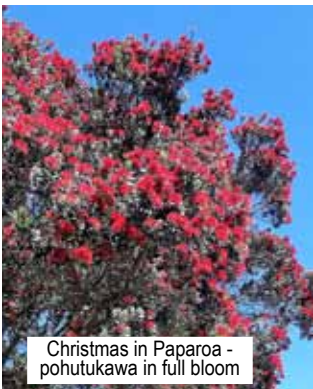
Christmas in Paparoa - pohutukawa in full bloom